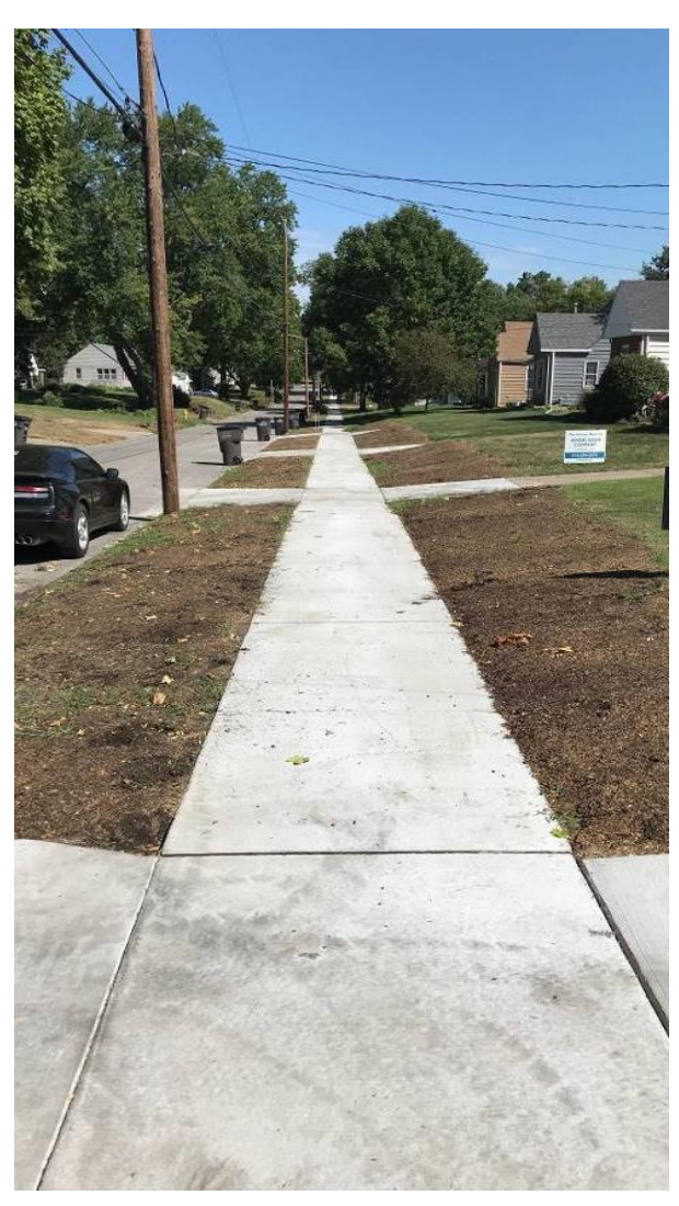
Sidewalk on 45th Street

Aurora Avenue 57<sup>th</sup> Street 50<sup>th</sup> Street (South side)