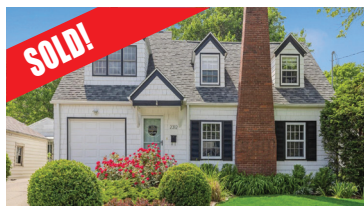
3701 37th St., DSM – SOLD! 2 Bed, 1 Bath, 1 Car, 686 sqft., built in 1950, .14 Acres