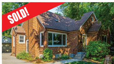
3406 Beaver Ave., DSM – SOLD! 3 Bed, 3 Bath, 3 Car, 2137 sqft., built in 1923, .32 Acres