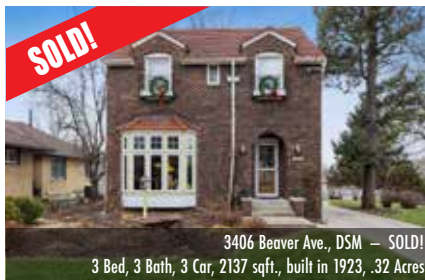
3406 Beaver Ave., DSM — SOLD! 3 Bed, 3 Bath, 3 Car, 2137 sqft., built in 1923, .32 Acres