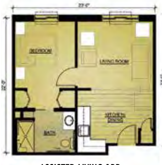
ASSISTED LIVING 1BR