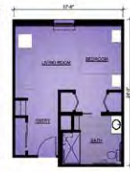
MEMORY CARE STUDIO

AT RIVERWOODS 2210 E PARK AVE, DES MOINES, IA 50320 PH: 515-288-4040