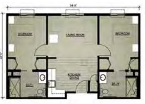
ASSISTED LIVING 2BR