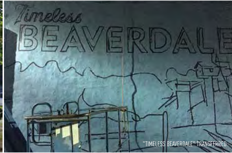
"TIMELESS BEAVERDALE" TRANSFERRED