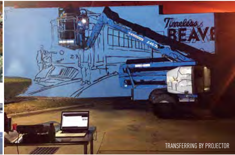
TRANSFERRING BY PROJECTOR