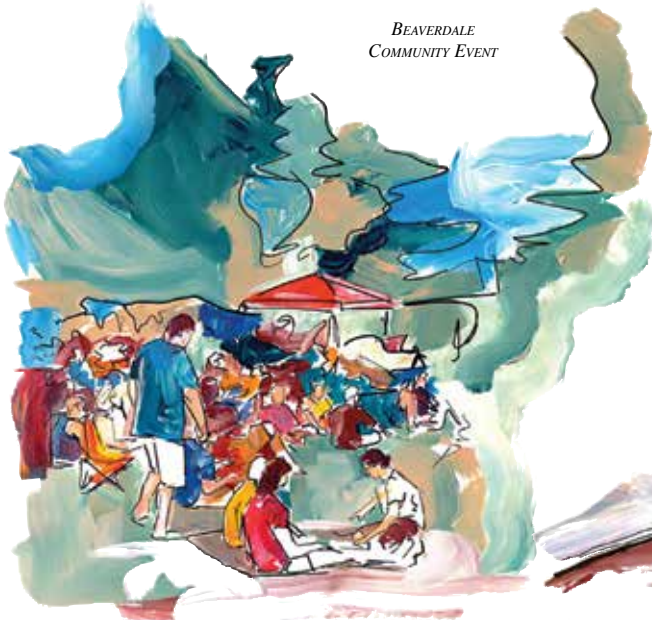
BEAVERDALE COMMUNITY EVENT

OR, MAIL A CHECK TO: BNA - CENTENNIAL MURAL P.O. BOX 30175 DES MOINES, IA 50310.