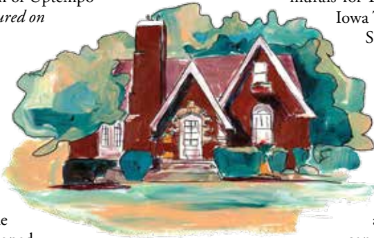
BEAVERDALE LOGO HOUSE