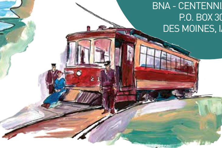
URBANDALE AVENUE TROLLEY